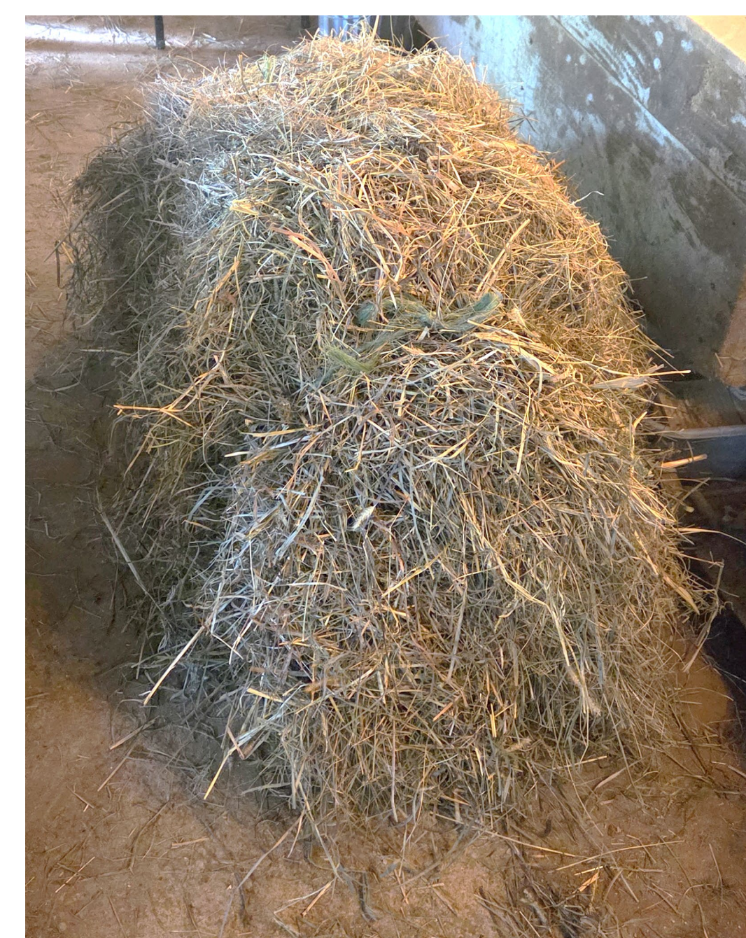
Figure 2 (right): This image shows one of the hay bales produced by the claw hay baler. The bale has a mass of 8.3 kilograms and was produced in 3.95 minutes. Compared to other bales, it required less production time while still achieving a higher mass, aiding in a favorable baling rate calculation. Notably, this was one of the first bales produced using the Hopp Baler and its success demonstrates both the practicality and user-friendly design of the round baling system.